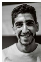
Suspended Ceiling Installer Mardin

How did you come to work in this field? My older brother has been doing this for almost 12 years, he was the one who introduced me to it. We work together. What do you think of the OMM building? It's rare to encounter such a distinctive building. It brought a breath of fresh air to Eskigehir. Have you had a chance to review the works in the museum? I've only been here for a few days. Unfortunately, I haven't had the chance to take a closer look at most of them.